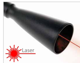
Long range module