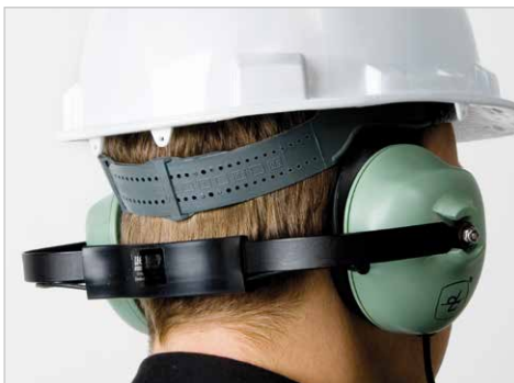
Headset for hardhat use