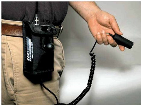
Holster for UP 201