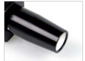
Close focus module