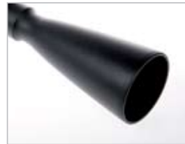
Long range module